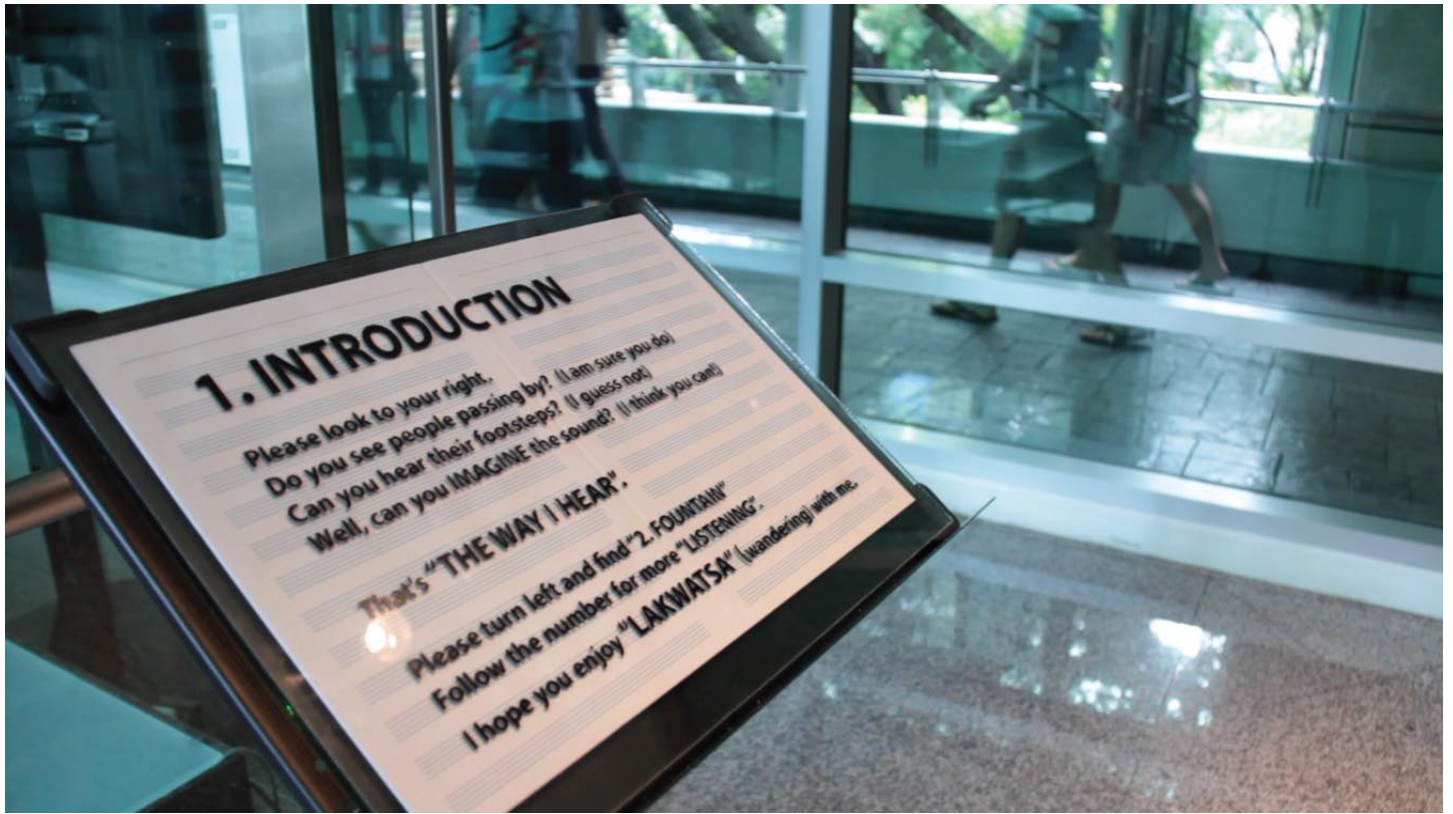
"1.INTRODUCTION", black glossy cutting letters, glass, music notebook, conductor stand, size of the text area:38×25cm

The following text is put on the glass case in which a broom is placed.